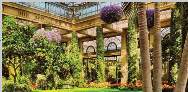
Longwood Gardens, Chester County