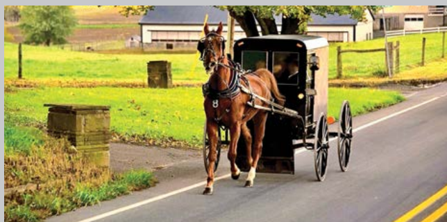
A horse and buggy along the highway, Lancaster County.