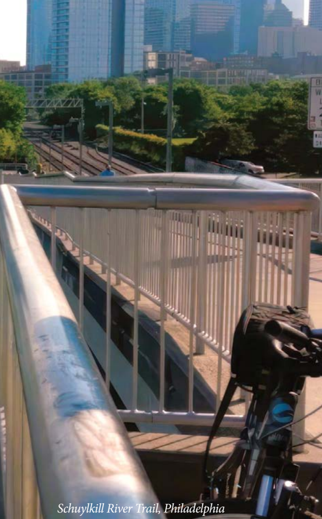
Schuylkill River Trail, Philadelphia