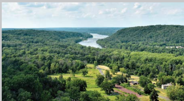
Delaware River from Bowman's Hill Tower, Bucks County