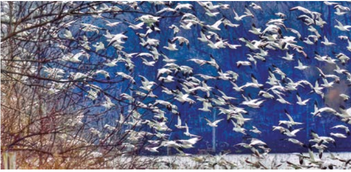
Snow geese at the Middle Creek Wildlife Management Area, Lancaster County.

The southeast region of Pennsylvania is a premier fishing and boating destination, with two major waterways and many lakes and streams. Add in the varied scenic landscapes and the large variety of things to do, and the whole family will find things they love.