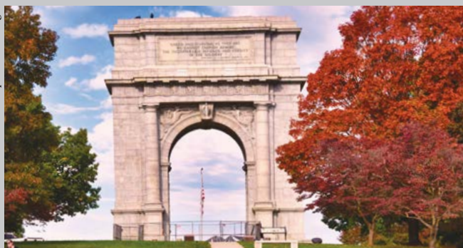
Valley Forge National Historic Park, Montgomery and Chester counties