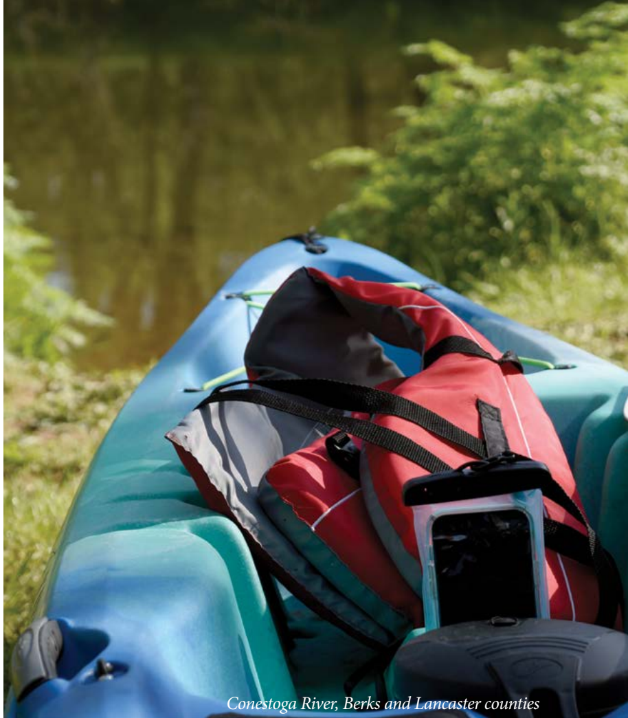
Conestoga River, Berks and Lancaster counties