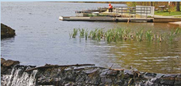
French Creek State Park, Berks and Chester counties

Regional designations are based on Pennsylvania Fish and Boat Commission Law Enforcement regions.